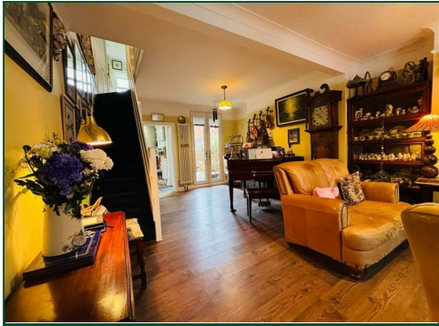
GROUND FLOOR 346 sq.ft. (32.1 sq.m.) approx.